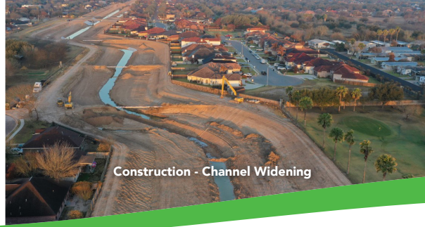
Construction - Channel Widening