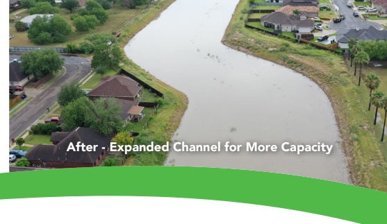
After - Expanded Channel for More Capacity